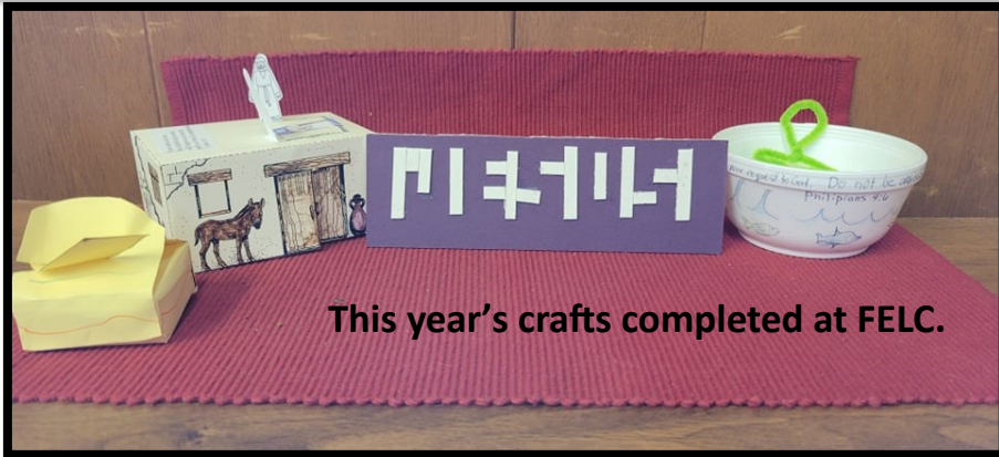
This year's crafts completed at FELC.