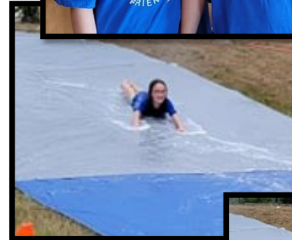
Last day of camp fun!